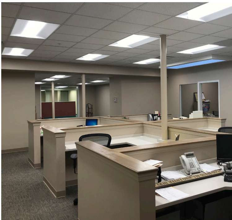
New office space on the second floor of the Resource Center; February, 2018.