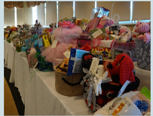
Guests enjoyed a variety of boutique items for sale, raffles, and auctions.