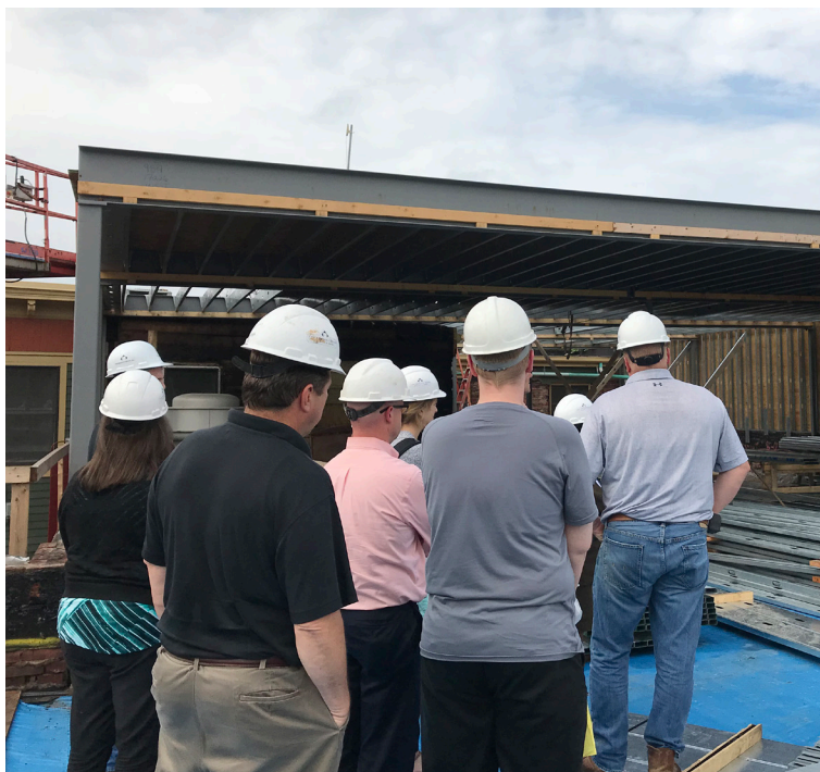
The Krueger Group gave WSCC staff a tour of the second floor expansion; October, 2017.