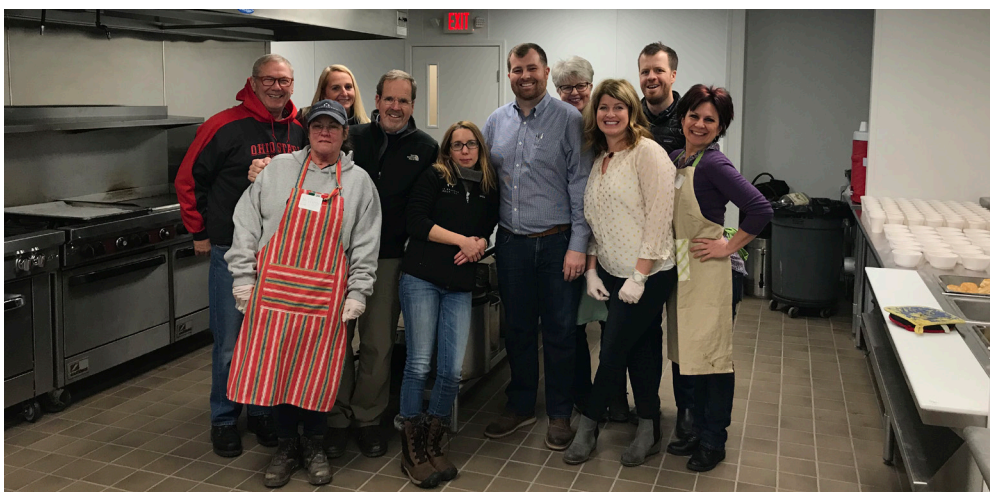
The Krueger Group, who is managing the renovation, served the first meal in the new Resource Center kitchen February 2, 2018.

We anticipate a late Spring grand opening of the new space. We would like to thank all of our volunteers and clients for their patience during this transition and look forward to better serving Cleveland with your support.