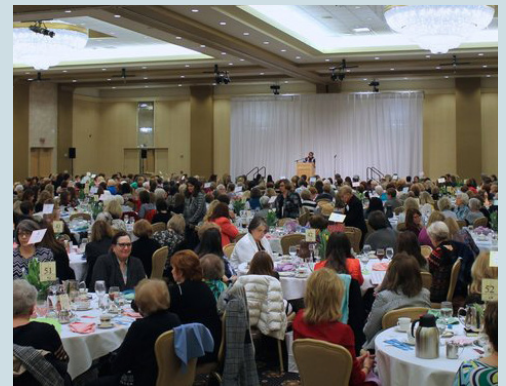
530 guests attended the 30th Anniversary event in March 2018.