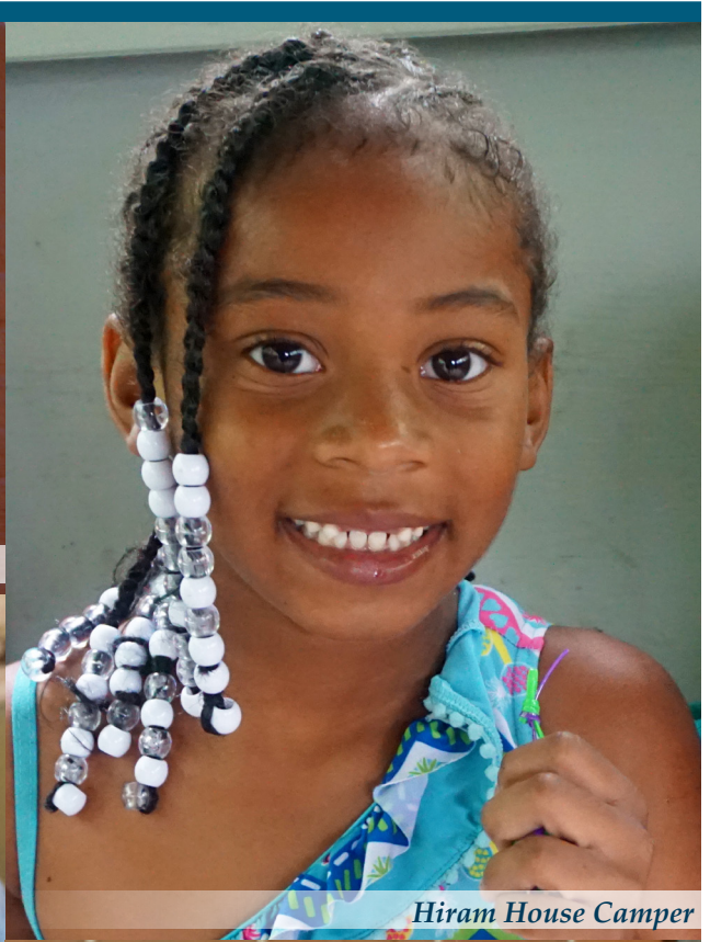
Hiram House Camper