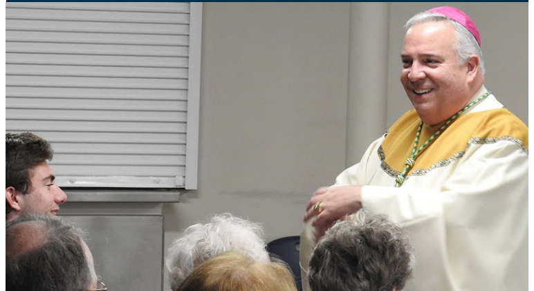
Bishop Perez celebrated Mass at WSCC on July 11, 2018