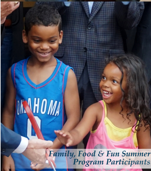
Family, Food & Fun Summer Program Participants