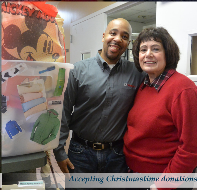
Accepting Christmastime donations